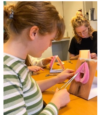
Textile models to take home

Date: Monday 09 September: 9 AM – 4 PM (7 hours incl. lunch)